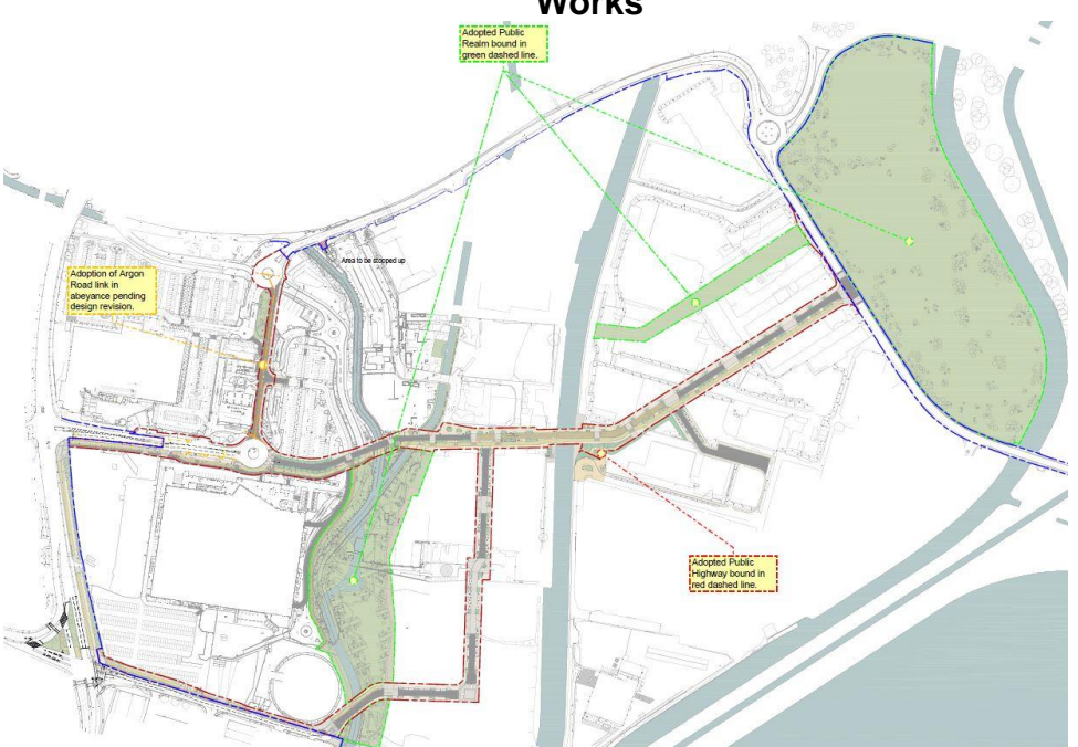
Figure 4: Proposed Plan of Adopted Strategic Infrastructure Works

Red (western area) – Meridian One/Teardrop site Yellow (middle area) – Phase 2 including Meridian Two Orange (eastern area) – East Bank area currently designated as Strategic Industrial Land