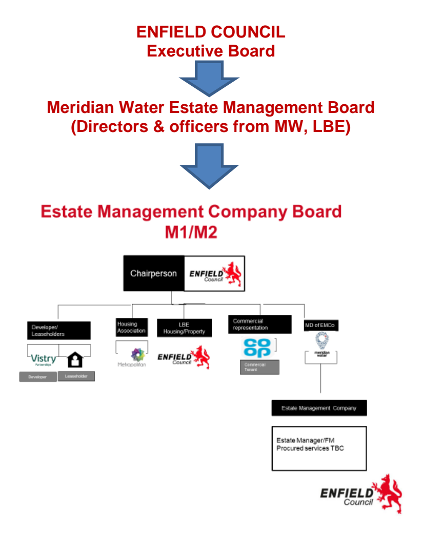
Figure 2: Organogram of relationship between Enfield Council and Meridian Water EMC